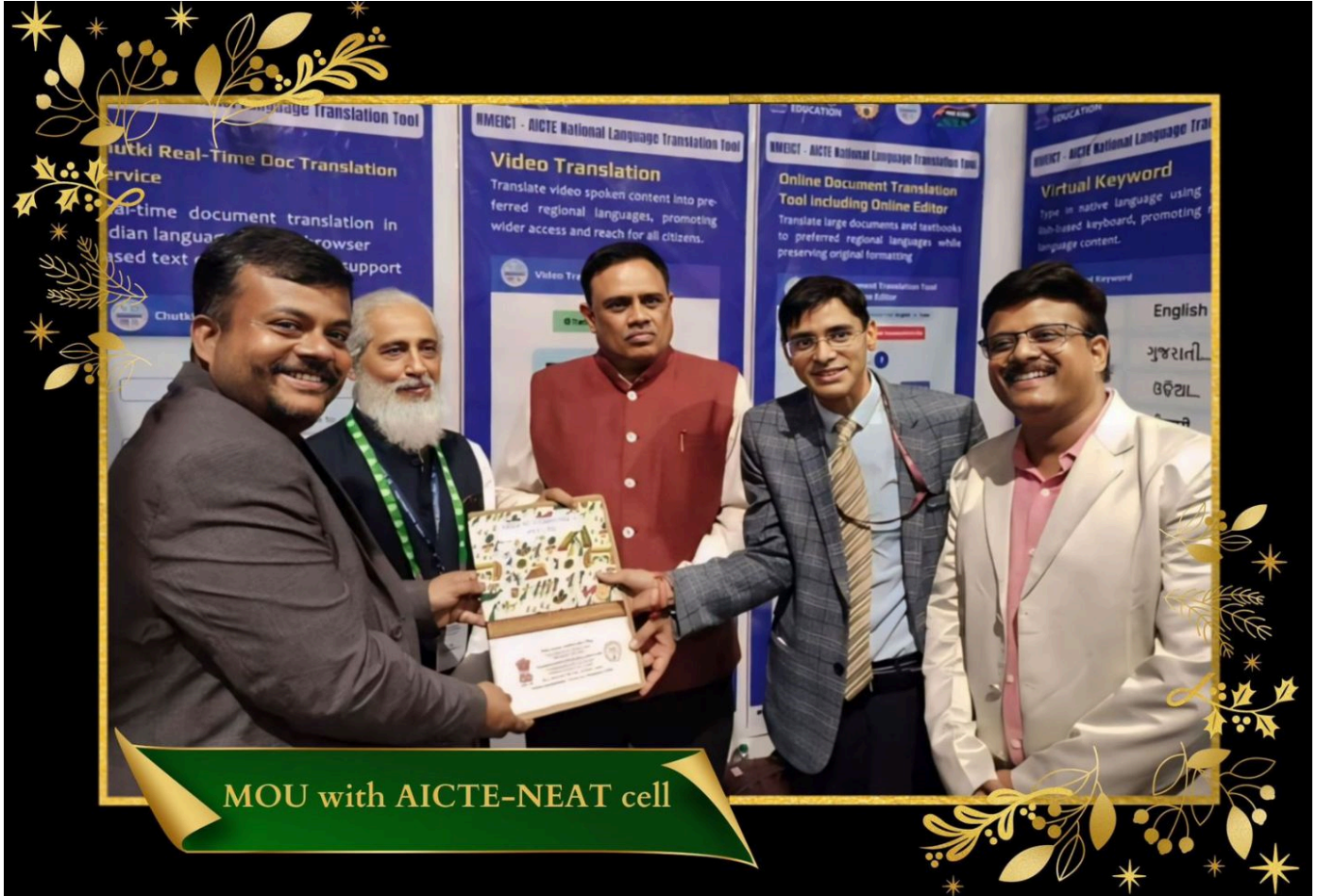
MOU with AICTE-NEAT cell